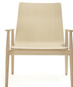
MALMO 299 ITEM CODE: HERPED299

COM(yds): 1,40 COL(sq ft): 26,00 Location: For indoor use Pieces per Box: 1 Packaging Volume(m3): 0,53 Gross Weight(lb): 22,05