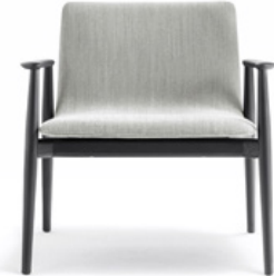
MALMO 296 ITEM CODE: HERPED296

Location: For indoor use Pieces per Box: 1 Packaging Volume(m3): 0,36 Gross Weight(lb): 17,64