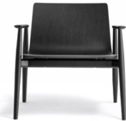
MALMO 295 ITEM CODE: HERPED295

Production lead time 8 weeks. Ash veneered plywood shell, solid ash wood frame and armrests. Warranty 2 years against construction defects.