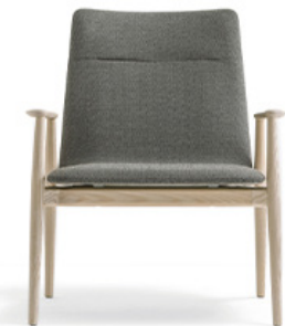
MALMO 298 ITEM CODE: HERPED298

Location: For indoor use Pieces per Box: 1 Packaging Volume(m3): 0,36 Gross Weight(lb): 19,84