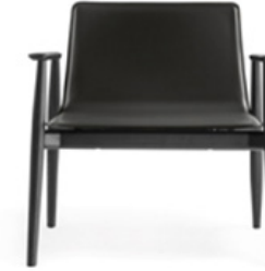
MALMO 297 ITEM CODE: HERPED297

COM(yds): 1,20 COL(sq ft): 22,00 Location: For indoor use Pieces per Box: 1 Packaging Volume(m3): 0,36 Gross Weight(lb): 20,28